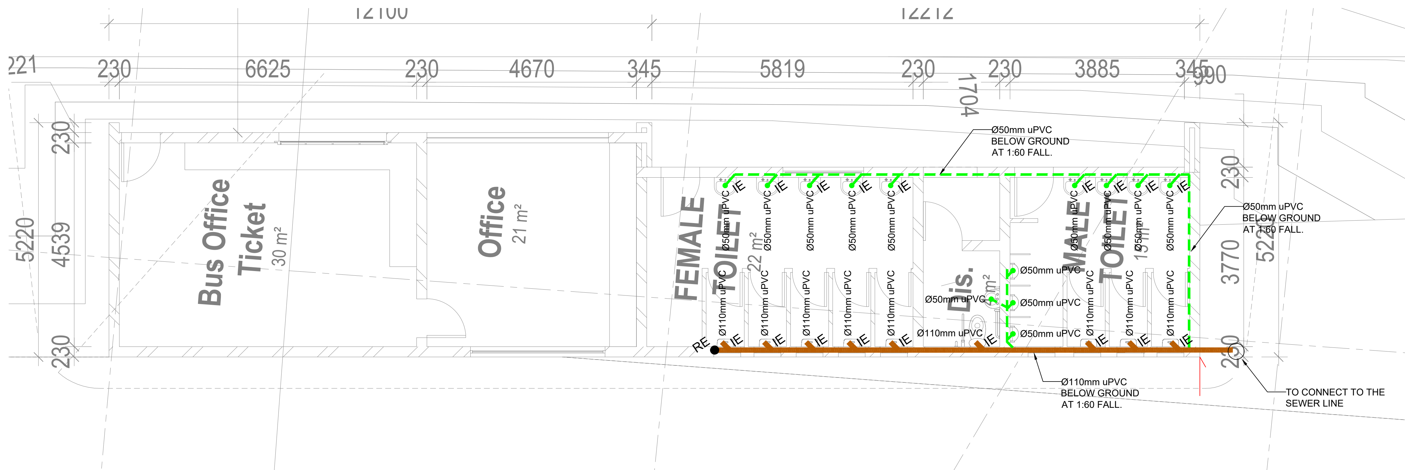
OFFICE TICKET BUILDING DRAINAGE LAYOUT SCALE 1:50